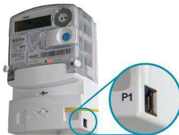
Image 2: Example of consumer port (P1 port) for real-time meter readings from the smart meter

Consumers can also directly retrieve meter readings from their smart meter at any time via the P1 port. Metering data is forwarded through the P1 port to an in-home device or web-based application at an interval of once every 10 seconds for electricity and every hour for gas. Smart metering feedback services via the P1 consumer port are direct or (near) real-time feedback, because of the high update frequency for electricity, in particular.